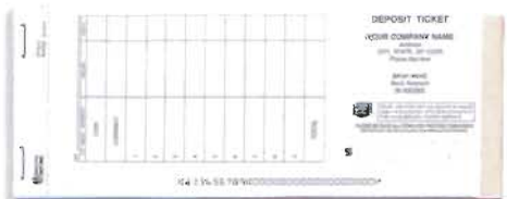
D DT-412 Booked Deposit Ticket, 3 1/2" x 8 5/8" Imprint area, 1 1/4" x 2 1/2" 50 sets per book