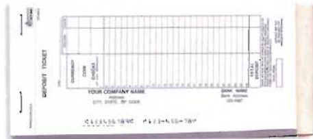
A DT-400 Booked Deposit Ticket, 3 1/2" x 7" Imprint area 3/4" x 5" 50 sets per book